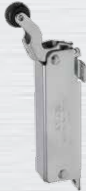
Kason Hydraulic Door Closure