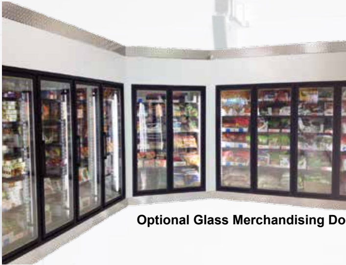
Optional Glass Merchandising Doors