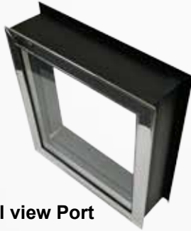
Optional view Port